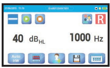
AUTOMATIC HUGHSON-WESTLAKE AUDIOMETRY