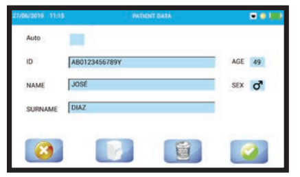
MANUAL ENTRY OF NEW PATIENTS