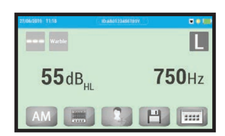
ILLUMINATED PATIENT RESPONSE BUTTON